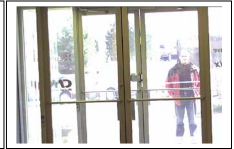
Low Dynamic Range Cameras