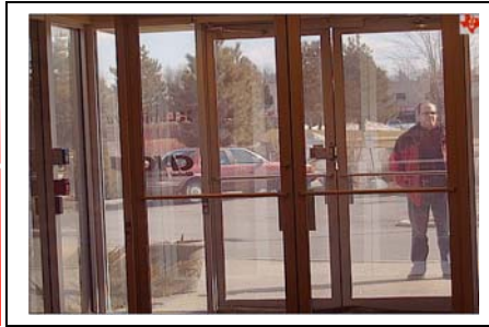
Le045 Ultra-Wide Dynamic Range