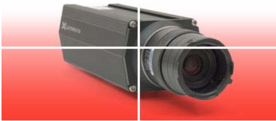
Ultra-Wide Dynamic Range Network Camera